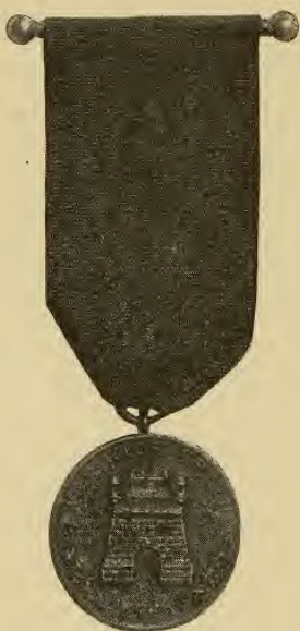
United States Army INDIVIDUAL SERVICE MEDAL

tiful place in the Hall of Honor in the Museum of the Army."